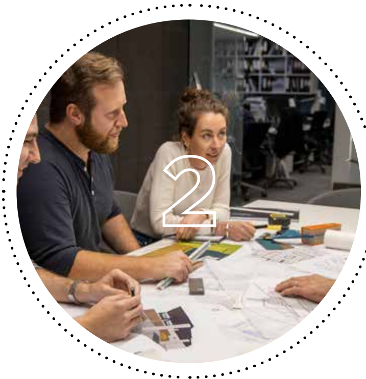
Understanding and getting to know you, your aspirations and your budget.