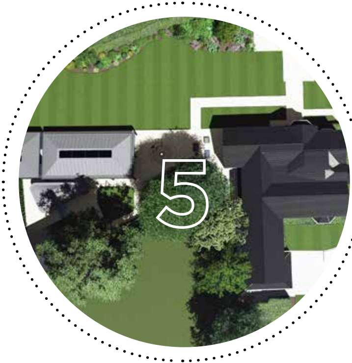
3D concept and project cost guidance.