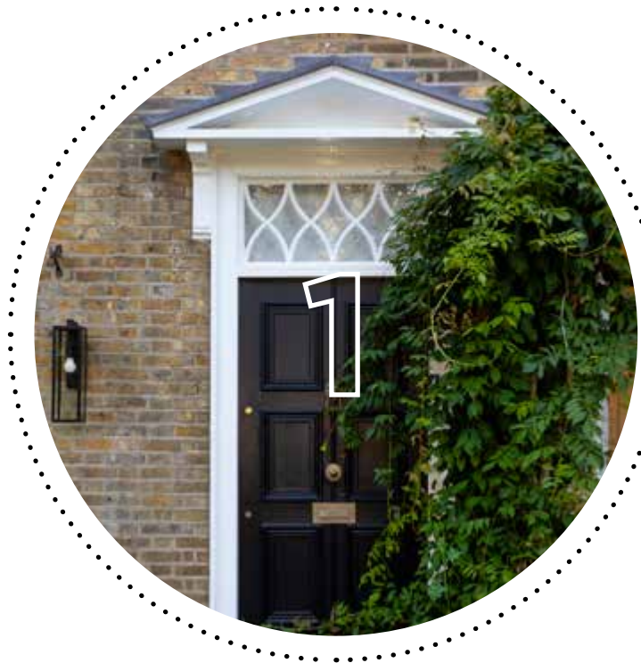
Site appraisal and analysis.