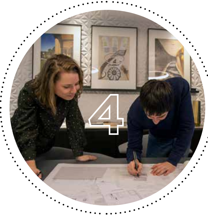
Interim design review.