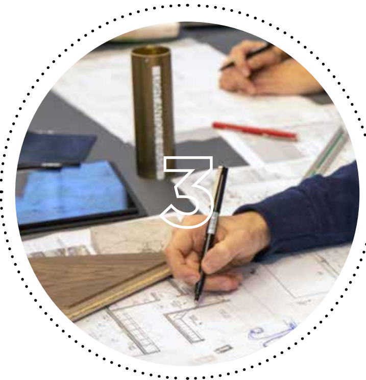
Sketch design scheme.