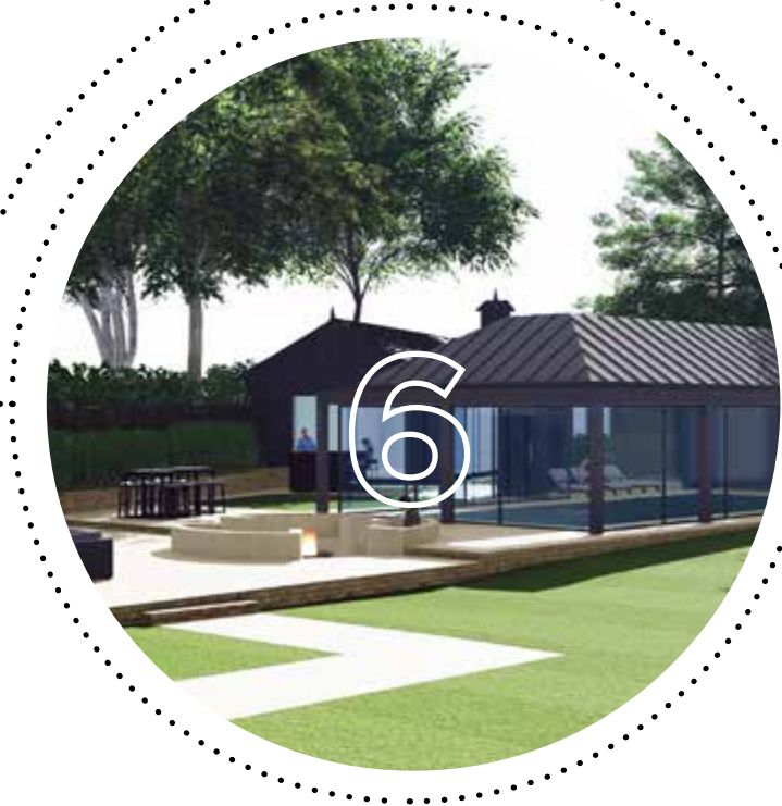
Step inside your new home with optional VR headset experience.*