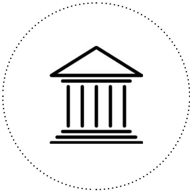
Contact with local authority.